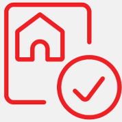
10 year Master Build Guarantee