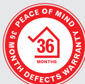
3 Year Defects Warranty