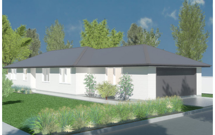
Kea 157m 2 | 3 bdrm | $715,000