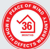
3 Year Defects Warranty