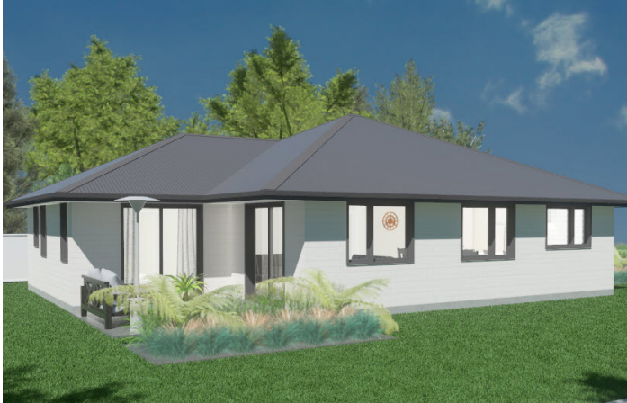
Carterton 1 126m 2 | 3 bdrm | $695,000